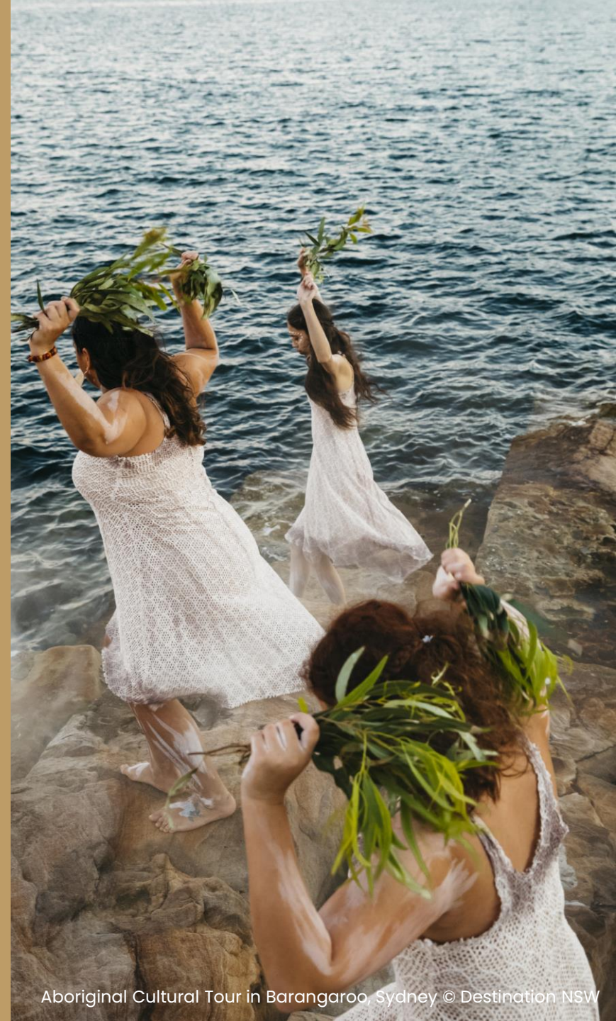
Aboriginal Cultural Tour in Barangaroo, Sydney

Australia is home to the oldest continuous living culture in the world. Aboriginal and Torres Strait Islander peoples are the First Nations people of the land we call Australia. There are hundreds of nations and each speaks its own language, with distinct dialects and cultural beliefs. The First Nations people of Sydney are the Gadigal of the Eora Nation. There are many opportunities for visitors to engage with First Nations knowledge, culture and history – from tours of the city's parks, gardens, waterways and icons (like the Harbour Bridge) guided by First Nations people to museum and gallery exhibitions and contemporary dance theatre .