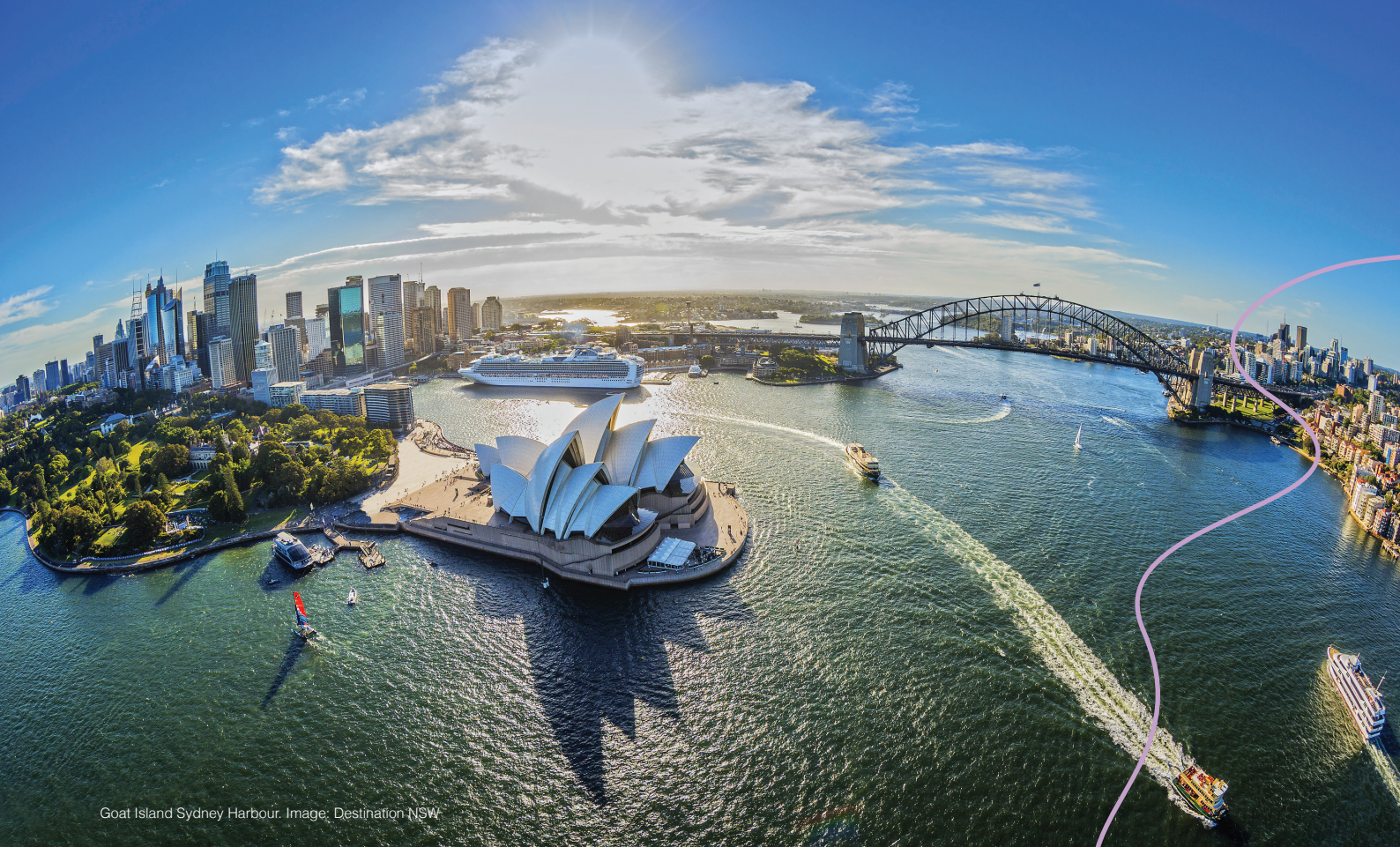
Goat Island Sydney Harbour.