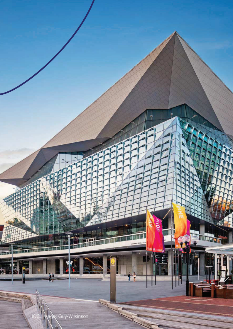
ICC Image: Guy-Wilkinson